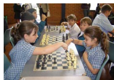
THE PRIMARY STUDENTS HARD AT WORK AT THE HRIS CHESS COMPETITION