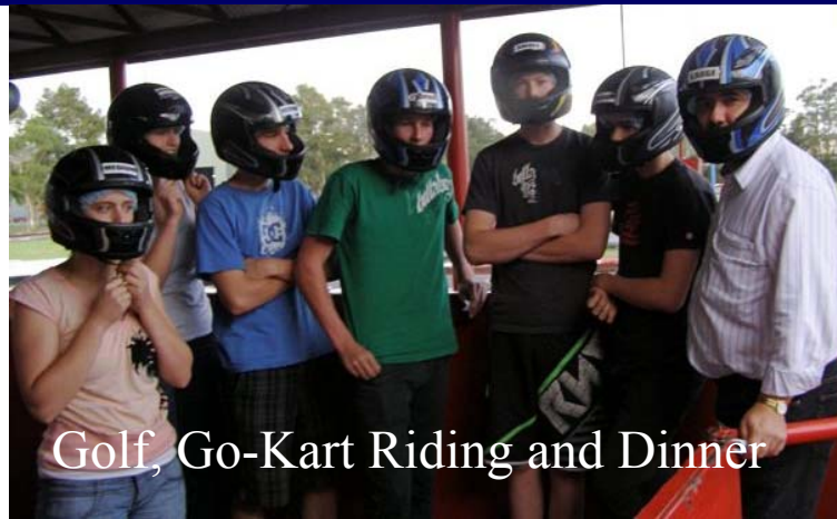
Golf, Go-Kart Riding and Dinner